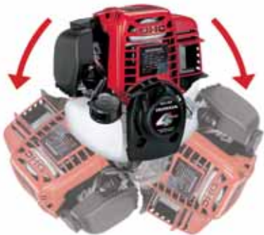
GX35 / HHT35

All Honda String Trimmers offer exclusive 360° inclinable 4-stroke engines, which means they can be used and rotated in any position.