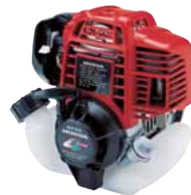
GX25 / HHT25

Designed to handle various applications, Honda offers two different models of the durable Mini 4-stroke engine: the GX25 and GX35. Choose the one that best fits the job at hand.